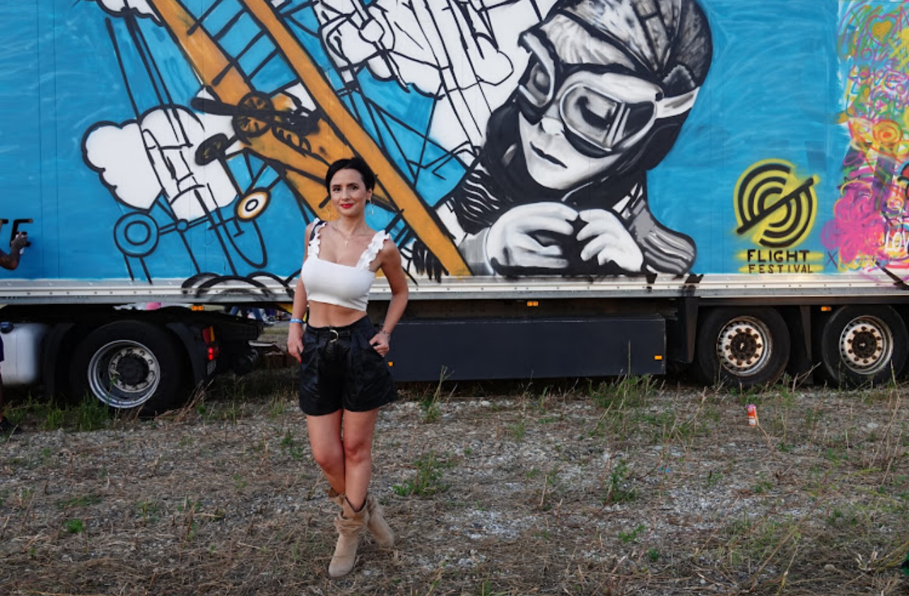
Street Art brings color and joy, the community loves being involved in this type of artistic projects.